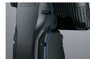
Aluminum Die-casting Back Cover for Optimal Thermal Dissipation