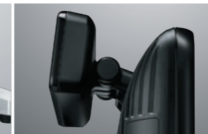
Modular Customer Display