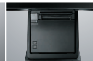
Flexibility to Integrate Receipt Printers of Your Choice