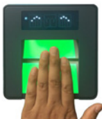
Left four fingers slap