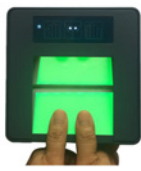
2 thumbs slap