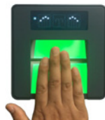
Right four fingers slap